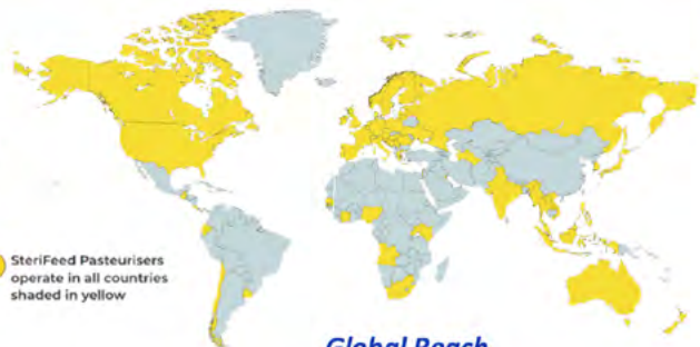
SteriFeed Pasteurisers operate in all countries shaded in yellow