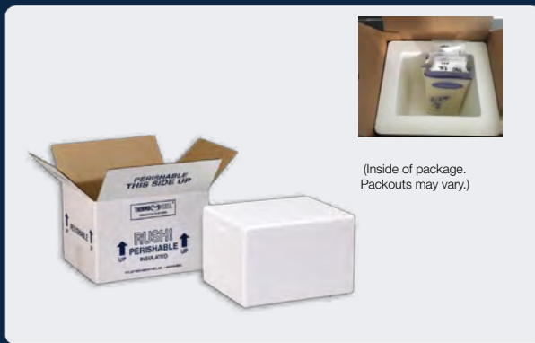
(Inside of package. Packouts may vary.)

Cold chain packaging engineered for donor human milk.